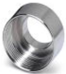
Step-up adapter, M32 to M40, including O-ring

Extension adapter - ENLAR-M-KV-M32/M40 - 1647682