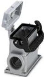
HEAVYCON box mounting base B6, with single locking latch and cover, height 74 mm, with support 2xM32

Please be informed that the data shown in this PDF Document is generated from our Online Catalog. Please find the complete data in the user's documentation. Our General Terms of Use for Downloads are valid ( http://phoenixcontact.com/download )