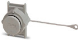
Protective cover, IP67, tall design

Please be informed that the data shown in this PDF Document is generated from our Online Catalog. Please find the complete data in the user's documentation. Our General Terms of Use for Downloads are valid ( http://download.phoenixcontact.com )