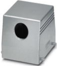
HEAVYCON sleeve housing D50, for double locking latch, height 76 mm, without support 1x M32, lateral conductor exit

Please be informed that the data shown in this PDF Document is generated from our Online Catalog. Please find the complete data in the user's documentation. Our General Terms of Use for Downloads are valid ( http://phoenixcontact.com/download )