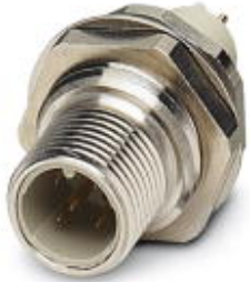
Sensor/Actuator flush-type plug, 5-pos., M12, A-coded, rear/screw mounting with Pg9 thread, with straight solder connection

Please be informed that the data shown in this PDF Document is generated from our Online Catalog. Please find the complete data in the user's documentation. Our General Terms of Use for Downloads are valid ( http://download.phoenixcontact.com )