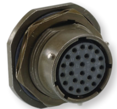
KPT | MIL-DTL-26482 Series I

KPT/KPSE connectors conform to MIL-C-26482 with a positive three point bayonet coupling, five-keyway polarization and high insert arrangement contact density. They are environmentally sealed, fully intermateable and accept a wide range of interchangeable accessories.