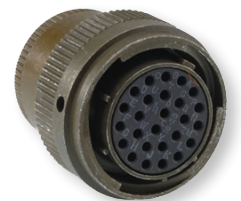
KPSE | MIL-DTL-26482 Series I / VG95328