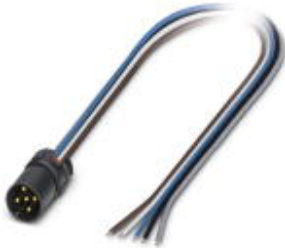
Assembled contact carrier and insulating body with 0.5 m litz wires and crimp contacts

Please be informed that the data shown in this PDF Document is generated from our Online Catalog. Please find the complete data in the user's documentation. Our General Terms of Use for Downloads are valid ( http://download.phoenixcontact.com )