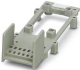
Plug receptacle, for plug assembly board, with strain relief, for accommodating contact inserts, type HC-B 10

Please be informed that the data shown in this PDF Document is generated from our Online Catalog. Please find the complete data in the user's documentation. Our General Terms of Use for Downloads are valid ( http://download.phoenixcontact.com )