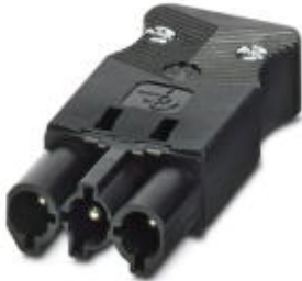
Connector for series connection, black, 3-pos.

Please be informed that the data shown in this PDF Document is generated from our Online Catalog. Please find the complete data in the user's documentation. Our General Terms of Use for Downloads are valid ( http://phoenixcontact.com/download )