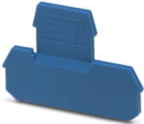
End cover, length: 62 mm, width: 5 mm, height: 40 mm, color: blue

Please be informed that the data shown in this PDF Document is generated from our Online Catalog. Please find the complete data in the user's documentation. Our General Terms of Use for Downloads are valid ( http://phoenixcontact.com/download )