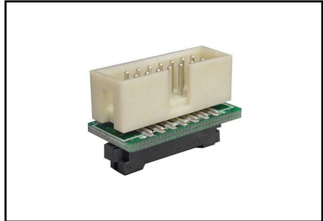
Figure 1 External View of the R0E000010CKZ00

The R0E000010CKZ00 allows connection of the E1 to a user system on which the only mounted connector is for the E20. However, the only available functions are those of the E1. Functions specific to the E20 are not available.