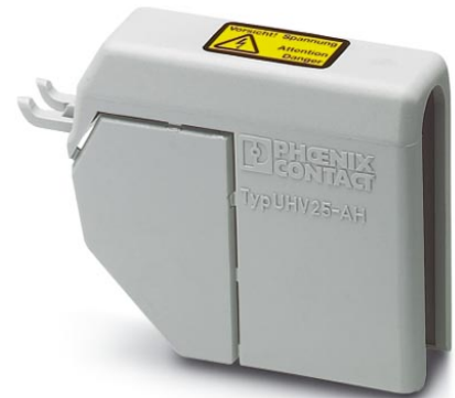
Illustration shows the product version UHV 25-AH

http://eshop.phoenixcontact.de/phoenix/treeViewClick.do?UID=2130457