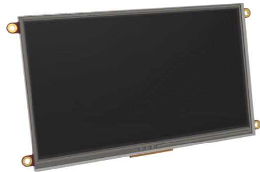
The uLCD-70DT Display Module