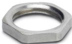
Flat nut with M16 thread

Please be informed that the data shown in this PDF Document is generated from our Online Catalog. Please find the complete data in the user's documentation. Our General Terms of Use for Downloads are valid ( http://download.phoenixcontact.com )