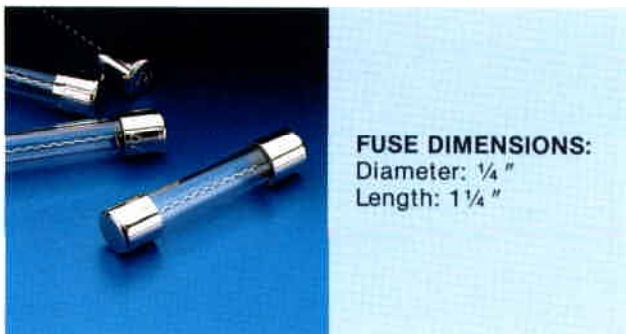
FUSE DIMENSIONS: Diameter: ¼" Length: 1¼"