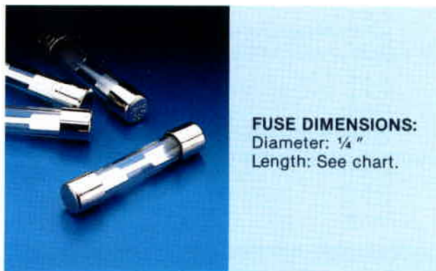
FUSE DIMENSIONS: Diameter: ¼" Length: See chart.