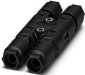
H distributor, QUICKON connection, No. of pos.: 3+PE, 0.5 mm 2 ... 1.5 mm 2 , 690 V, 17.5 A, black, Cable diameter: 8 mm ... 13 mm, with a sealing bolt

Please be informed that the data shown in this PDF Document is generated from our Online Catalog. Please find the complete data in the user's documentation. Our General Terms of Use for Downloads are valid ( http://phoenixcontact.com/download )