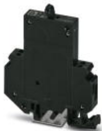
Thermomagnetic circuit breaker, 1-pos., normal blow, 1 N/C contact, with universal foot for mounting on NS 32 or NS 35

Please be informed that the data shown in this PDF Document is generated from our Online Catalog. Please find the complete data in the user's documentation. Our General Terms of Use for Downloads are valid ( http://phoenixcontact.com/download )