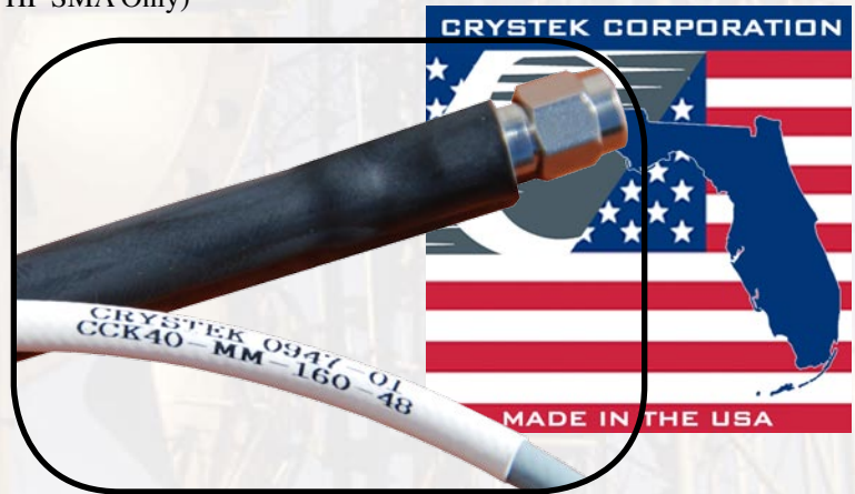
Electrical Test Data Supplied With Each Cable Assembly