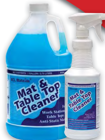
#6002 / 6001

Product #6002: Gallon bottle / 4 gallons per case