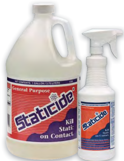
#2001 / 2003

Product #2003: 1-quart bottle / 12 quarts per case (including trigger sprayer) Product #2001: 1-gallon bottle / 4 gallons per case Product #2001-5: 5-gallon pail Product # 2001-2: 50-gallon drum