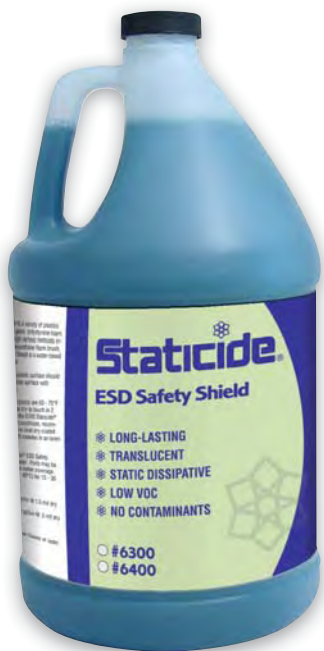
#6300 / 6400

Product #6400Q: 1-quart bottle Product #64001: 1-gallon bottle