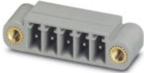
The figure shows the 5-pos. version of the product in gray

Header, Nominal current: 8 A, Rated voltage (III/2): 160 V, Number of positions: 7, Pitch: 3.5 mm, Color: pastel green, Contact surface: Tin, Mounting: Soldering