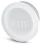
Plastic dust protection cap for connectors with M23 knurled nuts

Plastic dust protection cap - RC-Z2058 - 1604223