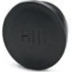
Plastic dust protection cap, anti-static, for RF, SF series connectors, with M23 external thread

Plastic anti-static dust protection cap - RC-Z2469 - 1611797