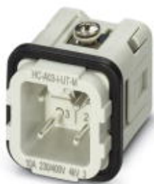
Contact insert, number of positions: 3+PE, size: D7, number of connections per position: 1, Pin, Screw connection, 230/400 V, 24 A, 0.5 mm 2 ... 2.5 mm 2

Please be informed that the data shown in this PDF Document is generated from our Online Catalog. Please find the complete data in the user's documentation. Our General Terms of Use for Downloads are valid ( http://phoenixcontact.com/download )