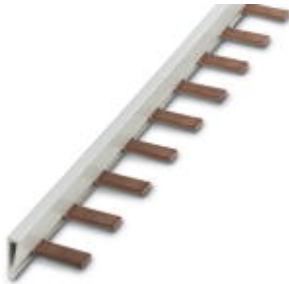
Insertion bridge, Number of positions: 36, Color: gray

Please be informed that the data shown in this PDF Document is generated from our Online Catalog. Please find the complete data in the user's documentation. Our General Terms of Use for Downloads are valid ( http://download.phoenixcontact.com )