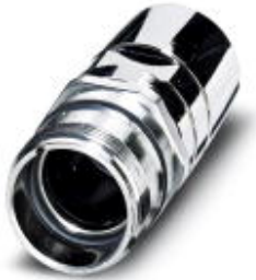
Sleeve housing for coupler connector, straight, Screw locking, M23, Shielded: No, Cable cross section: 10 mm...14 mm

Please be informed that the data shown in this PDF Document is generated from our Online Catalog. Please find the complete data in the user's documentation. Our General Terms of Use for Downloads are valid ( http://download.phoenixcontact.com )