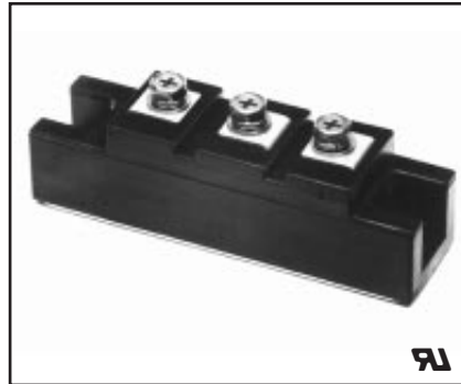
CD410830 Dual Diode POW-R-BLOK™ Modules 30 Amperes/800 Volts