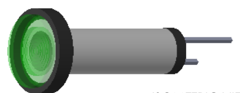
ISOMETRIC VIEW ONLY FOR REF.