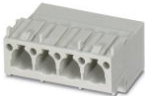
The figure shows the product version VC-AML 4

Mounting contact insert with PCB connection, type: 2, Number of pos.: 3+PE