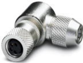
Sensor/actuator connector, socket, angled, 4-pos., M8, shielded, solder connection, metal knurl, cable diameter max. 5 mm

Please be informed that the data shown in this PDF Document is generated from our Online Catalog. Please find the complete data in the user's documentation. Our General Terms of Use for Downloads are valid ( http://download.phoenixcontact.com )