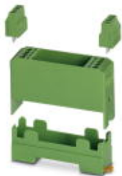
Electronic housing set, consisting of electronic housing and printed circuit termination blocks, pitch 5

Please be informed that the data shown in this PDF Document is generated from our Online Catalog. Please find the complete data in the user's documentation. Our General Terms of Use for Downloads are valid ( http://phoenixcontact.com/download )