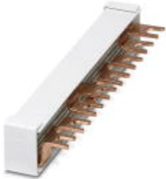
Wiring bridge for modules with connecting pitch 17.5 mm, 4-phase, 8-pos.

Please be informed that the data shown in this PDF Document is generated from our Online Catalog. Please find the complete data in the user's documentation. Our General Terms of Use for Downloads are valid ( http://phoenixcontact.com/download )