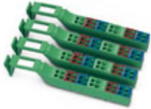
Connector set, for IB IL DI 16, copper, colored identification.

Please be informed that the data shown in this PDF Document is generated from our Online Catalog. Please find the complete data in the user's documentation. Our General Terms of Use for Downloads are valid ( http://phoenixcontact.com/download )