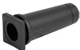
Cable Guard KT14 PVC Cable Guard for rewireable connectors