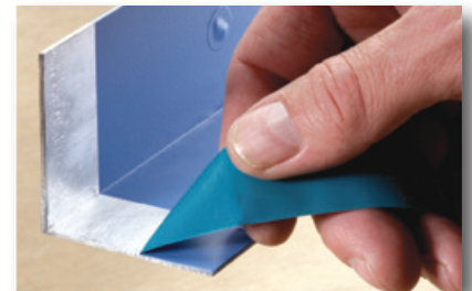
Clean removal, sharp paint edge.