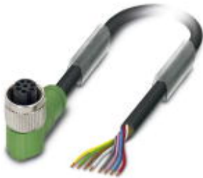
M12 socket, angled, 8-pos., with connected master cable, for sensor/actuator box with M8 slots, cable length: 5 m

Please be informed that the data shown in this PDF Document is generated from our Online Catalog. Please find the complete data in the user's documentation. Our General Terms of Use for Downloads are valid ( http://phoenixcontact.com/download )