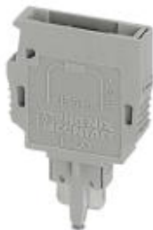
Component connector, with diode 1N4007, length: 24.2 mm, width: 5.2 mm, height: 33.3 mm, number of positions: 1, color: gray

Please be informed that the data shown in this PDF Document is generated from our Online Catalog. Please find the complete data in the user's documentation. Our General Terms of Use for Downloads are valid ( http://phoenixcontact.com/download )