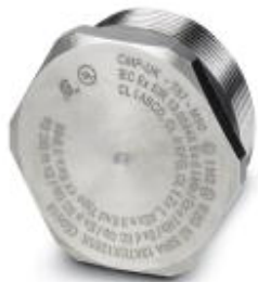
Screw plug, Nickel-plated brass, Application: Ex, Connecting thread: M63, Color: silver

Please be informed that the data shown in this PDF Document is generated from our Online Catalog. Please find the complete data in the user's documentation. Our General Terms of Use for Downloads are valid ( http://phoenixcontact.com/download )