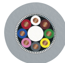
PUR, gray, shielded [285]