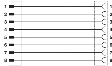
Contact assignment of M12 connector/socket