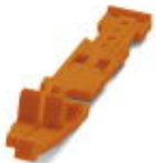
Latching, Length: 3 mm, Width: 5.2 mm, Number of positions: 2, Color: orange