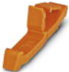
Latching, Number of positions: 1, Color: orange