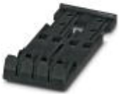
Strain relief, Number of positions: 4, Color: black