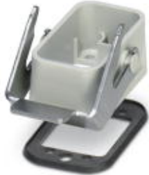
Panel mounting base with single locking engagement nose, straight design

Please be informed that the data shown in this PDF Document is generated from our Online Catalog. Please find the complete data in the user's documentation. Our General Terms of Use for Downloads are valid ( http://download.phoenixcontact.com )