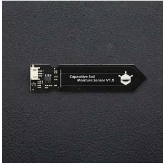
Capacitive Soil Moisture Sensor