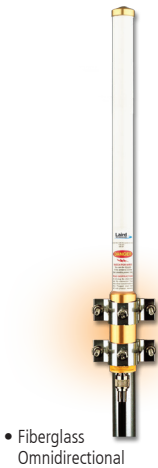
• Fiberglass Omnidirectional