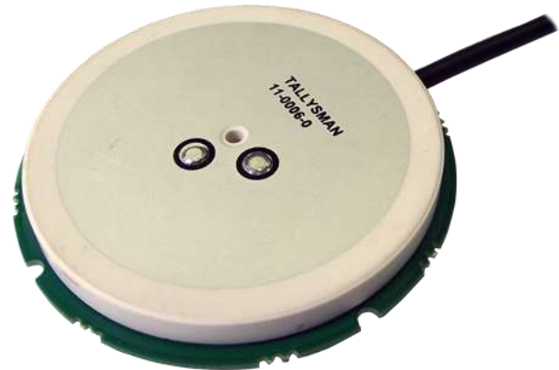
TW2605 Dimensions (mm)

The TW2605 provides excellent Iridium™ signal coverage, and comes in a compact circular form factor with a built-in 50 mm diameter ground plane. Standard coax cable is 15cm of RG174. Custom tuning, cable length, and connectors are available on request.