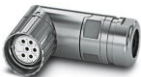
The figure shows the 6-pos. product version

Cable connector, angled, shielded: yes, Screw locking, M23, No. of pos.: 8+1, type of contact: Socket, Crimp connection, cable diameter range: 4 mm ... 6 mm