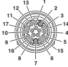
Connector pin assignment