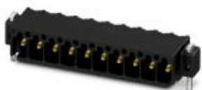
The figure shows the 10-position version

PCB headers, nominal current: 6 A, rated voltage (III/2): 160 V, number of positions: 16, pitch: 2.54 mm, color: black, contact surface: Gold, mounting: THR soldering, Fixed coding of the last position, can be combined with the FMC 0,5/...-ST-2,54 C2 connector